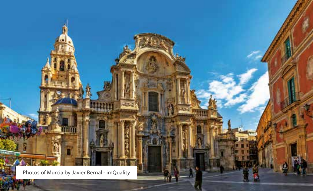
Photos of Murcia