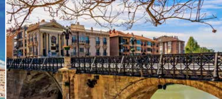
Cartagena (Mediterranean Sea)