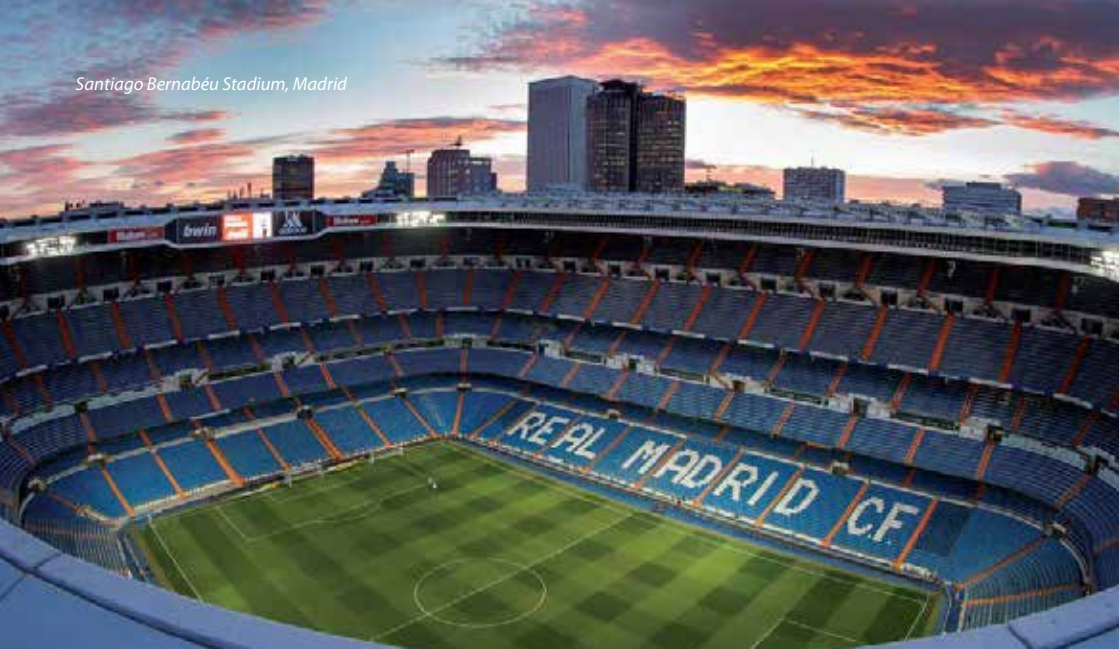
Santiago Bernabéu Stadium, Madrid